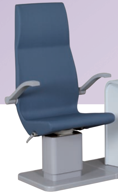
IS-600II basic unit with blue OC-6